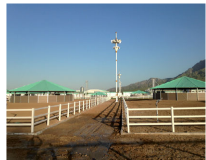
Four in one fell swoop!