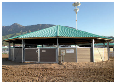
... the first one is completed!